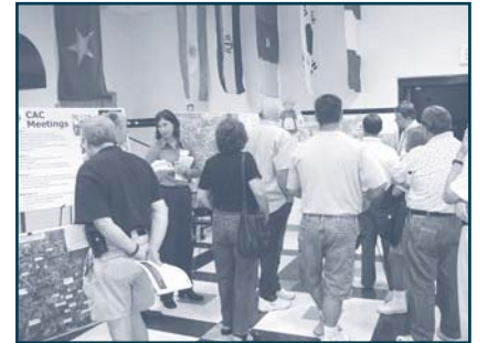
Citizens take a look at the proposed preferred alternative for the relocation of US 231.

The official comment period for the Draft Environmental Document ended October 18, 2002. Thank you to those that submitted comments. All formal comments on the draft Environmental Document, as well as those associated with the public hearing, will be reviewed and considered throughout November. ■