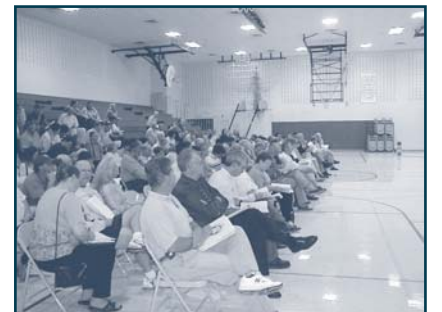
Over 215 people were in attendance for the public hearing held on October 3.